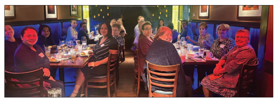
Desert Vista chapter members enjoyed an educational program on gastroparesis at the Phoenix City Grille on October 20, 2022.