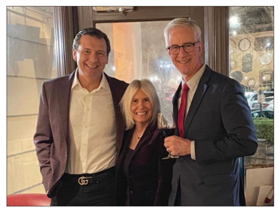
Greater Charlotte chapter members enjoyed networking at the chapter's annual wine and cheese raffle event.