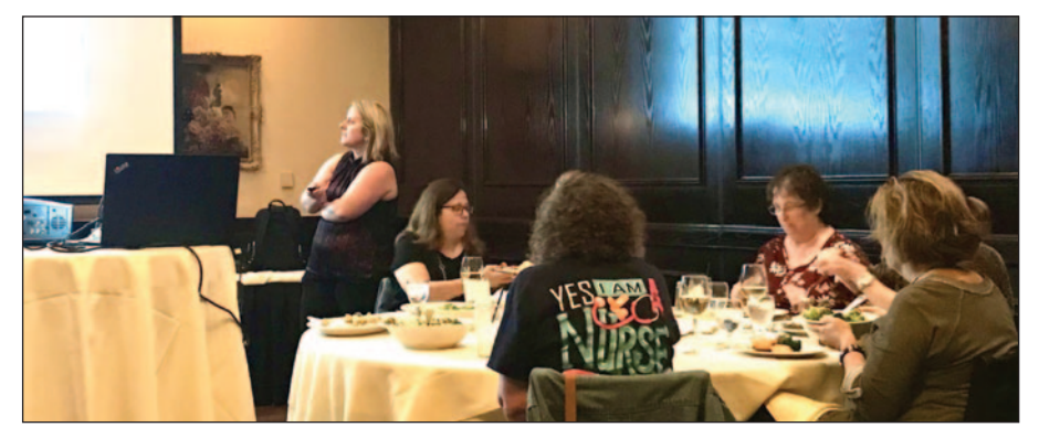
St. Louis chapter members gathered for an educational dinner on "Pruritus in Non-Dialysis-Dependent Chronic Kidney Disease" at Maggiano's Little Italy on October 10, 2022.