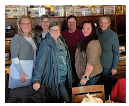
The Platte River chapter planning committee/executive committee held a business meeting at Kona Grill on November 20, 2022.

The chapter planning committee/ executive committee had a business