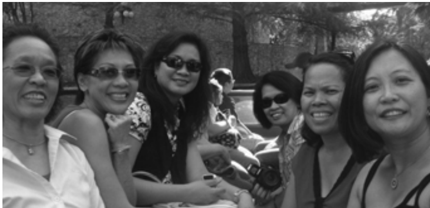
Inland Empire and Las Vegas chapter members enjoyed a boat ride along the San Antonio River Walk while in San Antonio for the National Symposium.