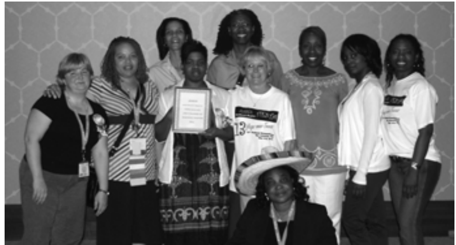
Dogwood chapter members received the Chapters Strategic Collaboration Award at the National Symposium in San Antonio.

health care professionals for a total of 103 attendees. This event was held on April 28 in the lovely town of Aguadilla on the western tip of the island.