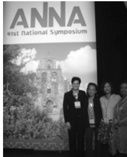
Inland Empire chapter members enjoyed networking opportunities at the National Symposium in San Antonio.

On March 14 our chapter held a conference at the Hampton Inn Suites in downtown Boise, ID, entitled A Focus on Nephrology Issues that Impact Nursing Today . Thirty-five registered nurses attended and