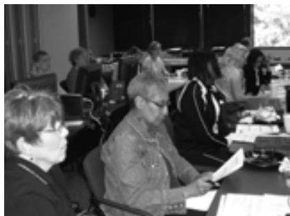
A room full of nurses were very interested in an educational program entitled "CRRT, Understanding the Critically Ill Patient" and hosted by the Central Virginia Chapter.